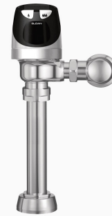
Variation Not Shown: Trap Primer